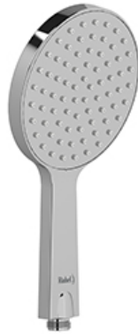
1-jet hand shower 4319